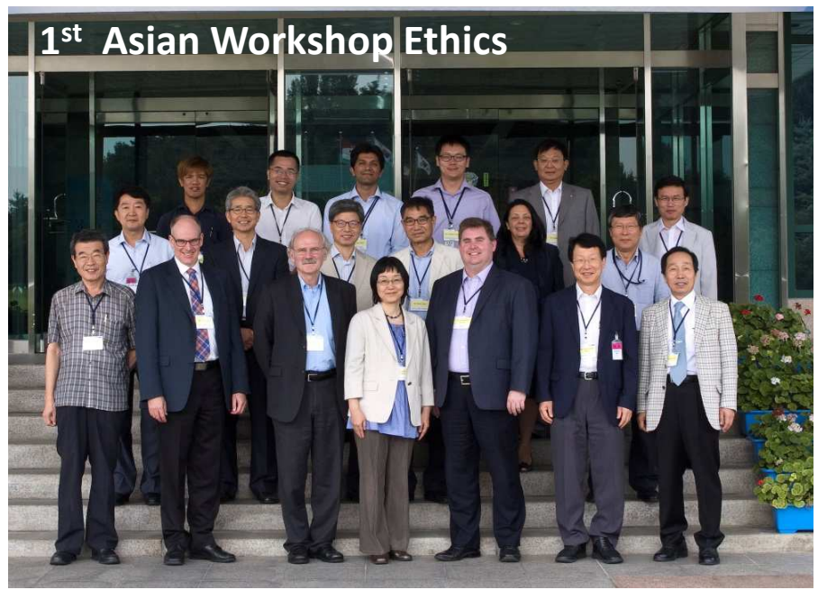
Daejeon, Aug 2013