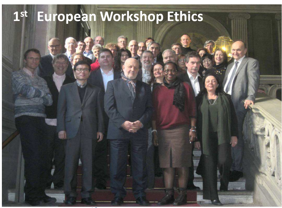
Milan, Dec 2013