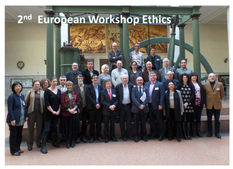
Madrid, Feb 2015