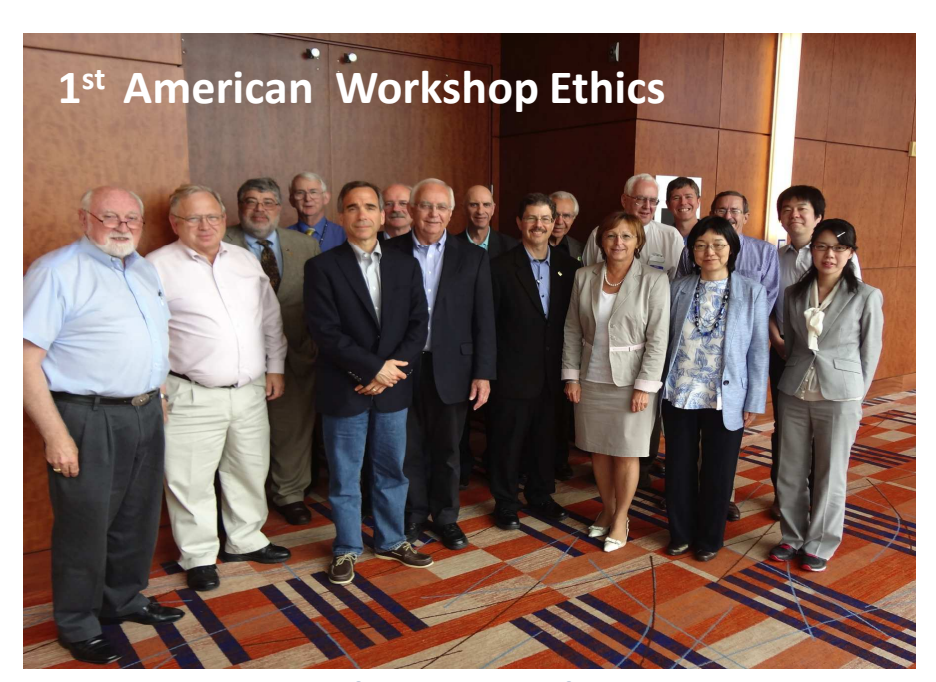
Baltimore, July 2014